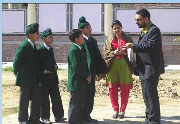
'Apnepan ka vistaar' - parents adopt a 'cause'

SAMEER Clubs : or S ocial A ction M ovement for E ducation and E co- R estoration Clubs have been conceptualised by REACHA (at Manava Bharati School, New Delhi, also our IM) as a means to provide a platform to school children to practice moral values in school through the method of "learning-by-doing". Educational experts from CBSE, ILB and NIEPA have recommended this approach for implementation in schools. This concept has been adopted by a number of public schools. REACHA's partnership with NDPL (elaborated later) for running NDPL ENERGY CLUBS is based on these "learning-by-doing" modules of child development evolved through SAMEER CLUBS.