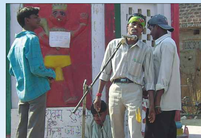
A 'nukkad naatak' by Gram Prabandhaks (Rural Managers) in a village