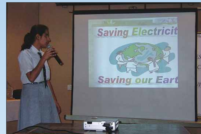
Today's student, tomorrow's conscientious leader

What children need from the teacher is encouragement, proper material, class management and companionship.