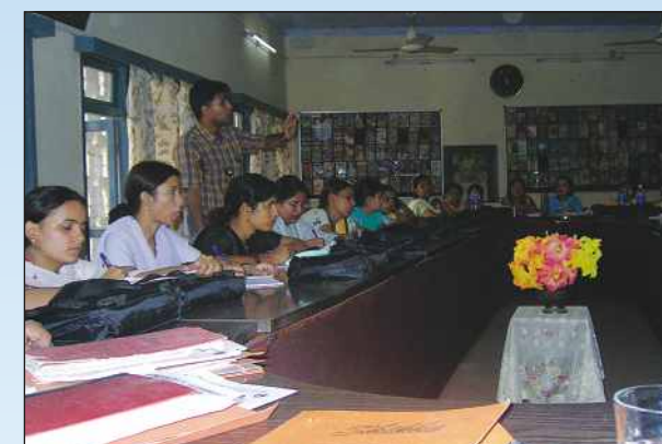
Intense training workshops

REACHA has also been instrumental in orienting over 10,000 volunteers in the last one decade, to improve the living conditions in the rural areas of the whole country. Lucknow, the capital of Uttar Pradesh, is one district where the consequential process of rural transformation has now begun to become visible.