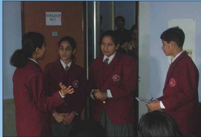
Street plays as powerful tools for social mobilisation

Although we have been working for "Nayee Talim" (new education) all these years, so far, our course was mapped out. We have now before us uncharted waters, with the Pole Star as our only guide and protection. That Pole Star is village handicrafts.