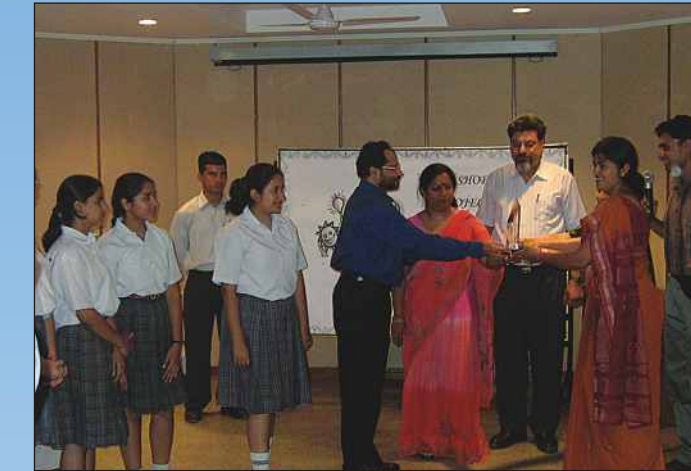
Awards & Scholarships as morale boosters

It is the egocentricity of the teacher that he thinks that he can teach. As long as we cherish this pride, we will never be able to understand the essence of education.