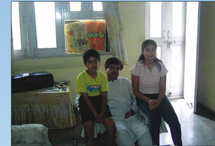
Parents join the crusade to save energy, and get en'lightened' too!!