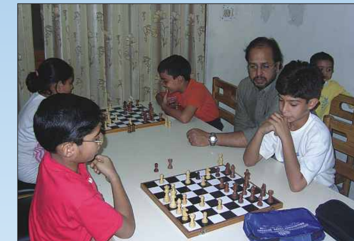
Maitreya kids try out their hand at chess under watchful eyes of a parent