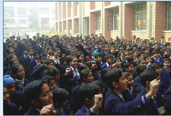
School kids 'pump the air' in solidarity

ILB publishes a quarterly magazine " ऋचा ऋतम्भरा " in Hindi from Lucknow, in association with REACHA that focuses on action & result-oriented creativity. It is widely circulated to all District Magistrates in the country, premier developmental institutes, schools, colleges and conscientious citizens & NGOs. " कुछ तो करना ही होगा " - is a compilation of articles written by Chairman, REACHA, since 1997 to 2005, pointing out glaring areas of deficiency in society & the remedies thereof by citizens themselves. "A BAT for all Seasons" is a satire on the education system today, in the form of an engaging fable, reminiscent of the Jataka Tales. The theme of 'Maitreya' (friendliness) as the way forward runs through the fable. "Disaster Management: towards a National Response System" , "Let's Do Something for Everyone" , "Uttaranchal : A Perspective" are some of the other publications.