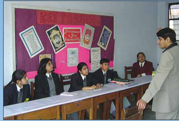
An Energy File (e-File) presentation by students of NDPL Energy Club

originate in Uttaranchal. Every water stream & water source of this state contributes water to these two rivers. To keep Ganga & Yamuna clean, Uttaranchal has to wake up! The State Govt & REACHA (ILB) are working together for this. This campaign has now acquired an All-India dimension with the inclusion of all the rivers, water streams & water sources of India . Every Indian is requested to join. Eradication of Parthenium (Gaajar Ghaas) is yet another major initiative launched since 2003 by cutting it in June & up-rooting it in July every year .