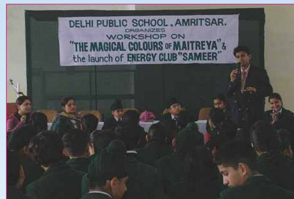
A SAMEER Club being launched

REACHA worked extensively with other NGOs for maximizing the reach of the Pulse Polio Immunisation Programme from 1996-99 (with WHO support); holds workshops on Women's Empowerment, "Health for All", and Reproductive and Child Health (RCH) in collaboration with ILB, Lucknow, and Population Foundation of India (PFI). Population stabilization &