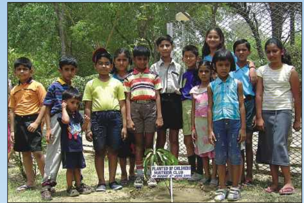
'Maitreya' children prepare to give back to nature

REACHA has also been instrumental in orienting over 10,000 volunteers in the last one decade, to improve the living conditions in the rural areas of the whole country.