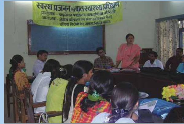
Fieldworkers being sensitized on RCH

REACHA oriented the faculty at Yug Nirman Mission, Shantikunj, Haridwar, one of our distinguished Institutional Members (IM), for setting up a 'rachnaatmak prakosht' (Creative Cell) at Shantikunj, for training farmers, government functionaries, volunteers of NGOs and individuals in Self-Help-Group (SHG) formation, mobilisation of micro-credit for local development, rain-water harvesting through water-