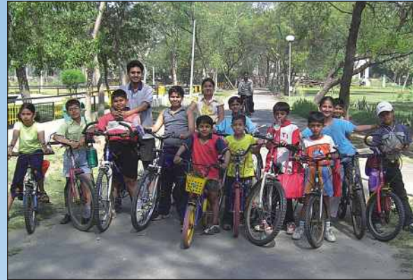
'Maitreya' kids on a cycle trail - exploring to seek!

REACHA campaigns extensively for eco-friendly development. It seeks to develop partnerships with other govt & non-govt organizations for achieving goals of sustainable livelihood. One such is keeping the rivers, water streams & water sources of Uttaranchal clean: Ganga & Yamuna, the two most sacred rivers of India,