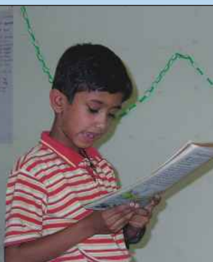
A 'Maitreya' child has a story to tell!

REACHA is always on the lookout for simple, sincere aspirants who have the courage to experiment & explore their own hidden talents & offers them partnership on equal terms in this man-making enterprise.