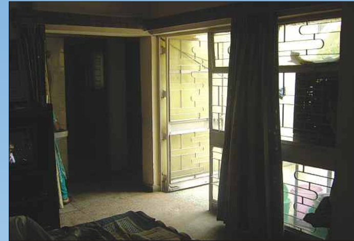
Kids show how natural light can make a fashion statement

Nothing is more crushing to the infant spirit than a parents' or a teacher's contempt for those creative efforts of expression, as child's art, which is its passport to freedom, to the full fruition of all its gifts and talents, to its true and stable happiness in adult life.