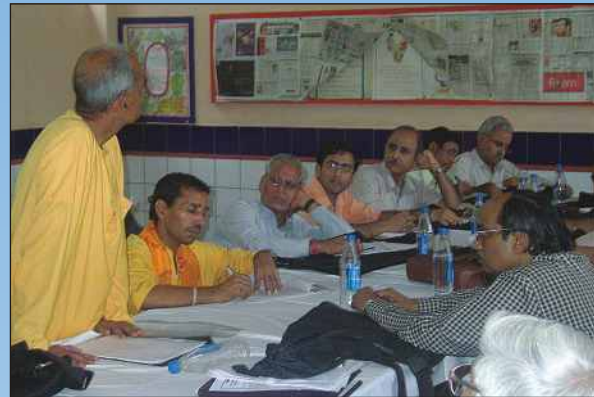
Workshop on Animal Husbandry

shed development in rain-fed areas & comprehensive rural development (REACHA undertook a project in 1996-98 with support from NABARD, under RBI, for the above programme) & training of Rural Managers (an ongoing programme, in association with India Literacy Board, ILB, Lucknow. ILB is also an important IM). REACHA also took up the greening of barren lands at Bhatti Mines near Delhi in 1992-93.