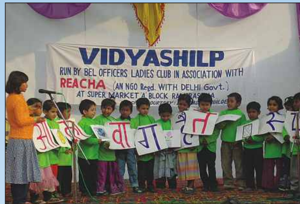
A unique effort to 'touch' the less fortunate

shed development in rain-fed areas & comprehensive rural development (REACHA undertook a project in 1996-98 with support from NABARD, under RBI, for the above programme) & training of Rural Managers (an ongoing programme, in association with India Literacy Board, ILB, Lucknow. ILB is also an important IM). REACHA also took up the greening of barren lands at Bhatti Mines near Delhi in 1992-93.