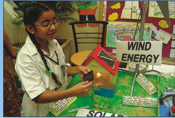
A SAMEER Club child explains the 'way forward'

Child Development Workshops/sessions in Schools/Corporates/Residential Colonies : have been held in association with the following: NDPL; Think Inc; Manava Bharati School, Panchsheel Park (South), New Delhi; Manava Bharati School, Mussoorie; City Montessori School, Lucknow; CRPF Public School, Rohini, New Delhi; Prabhu Dayal Public School, Delhi; Lancers Convent, Delhi; Bal Bharati Public School, Delhi; DAV Shreshth Vihar, Delhi; Apeejay School,