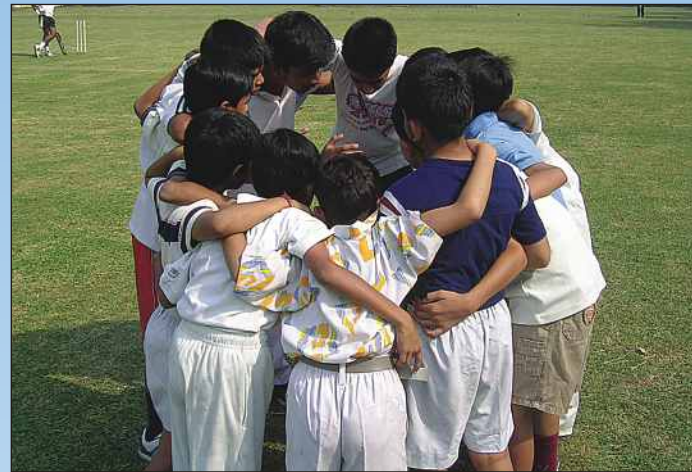
Team spirit in kids across age barriers instills great confidence

Wealth is a golden cage in which children of the rich are bred into artificial deadening of their powers. Therefore, in my school (Shantiniketan), much to the disgust of people of expensive habits, I had to provide for this great teacher - this bareness of furniture and materials - not because it is poverty, but because it leads to personal experience of the world.