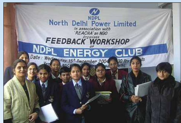
Students & teachers provide valuable feedbacks