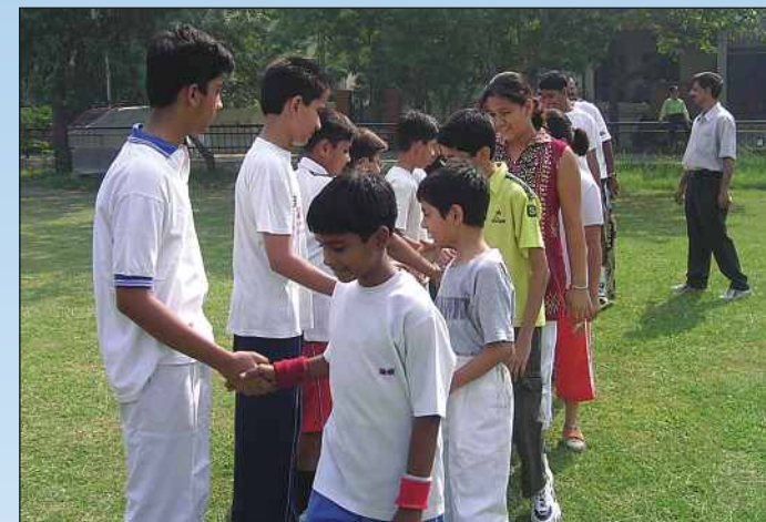
Comaraderie across age barriers in the neighborhood

Every act done with a sense of beauty, grace and human relevance is art, and every object created with care is an artifact.