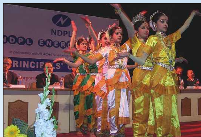
NDPL Energy Club children invoke the divine powers

We have come to this world to accept it, not merely to know it. We may become powerful by knowledge, but we attain fullness by sympathy with all existence.